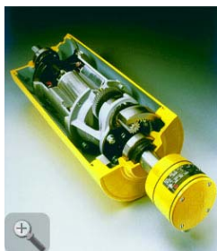
Note compactness of 10 hp motorized pulley.

Rulmeca Motorized Pulley usage recently expanded when Inertia recently included 10 and 15 hp units into the company's 4048 closed circuit plant, currently under construction, driving the 100 tph closed circuit and 300 tph delivery conveyors, respectively.