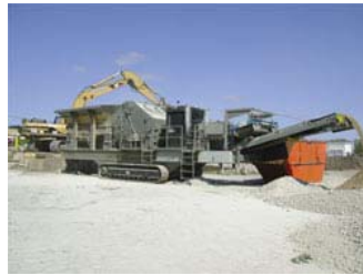
5066 Tracker diesel engine drives crusher, hydraulic pumps for tracks and clutch and generator for all electric motors.

Since their first Rulmecca Motorized Pulley purchase, Inertia Machine and their customers obtained significant benefits from the internally powered drives and standardized on the compact drives to power key conveyors.