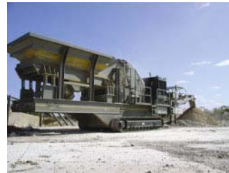
Inertia Machine's 5066 Tracker features Rulmecca Motorized Pulley model 400M at 15 hp to move up to 700 tph of crushed product at 300 fpm, using 460v/3ph/60Hz.

As shown here, Inertia's 5066 Tracker uses a 15 hp Rulmecca Motorized Pulley to drive the 42-inch rear discharge conveyor. This belt transfers up to 700 tph of shot rock limestone, recycled asphalt and recycled concrete at 300 fpm from the huge horizontal shaft impact crusher to the discharge point.