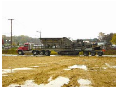
5066 Tracker features quick and easy transport capability using built in three axle bogey.

In addition to the powerful crusher, plant compactness and portability are key features of the 5066 Tracker. Note that it is the only tracked plant of its size capable of being transported from pit to pit without disassembly.