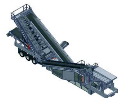
CAD files for Rulmecca products are downloadable.