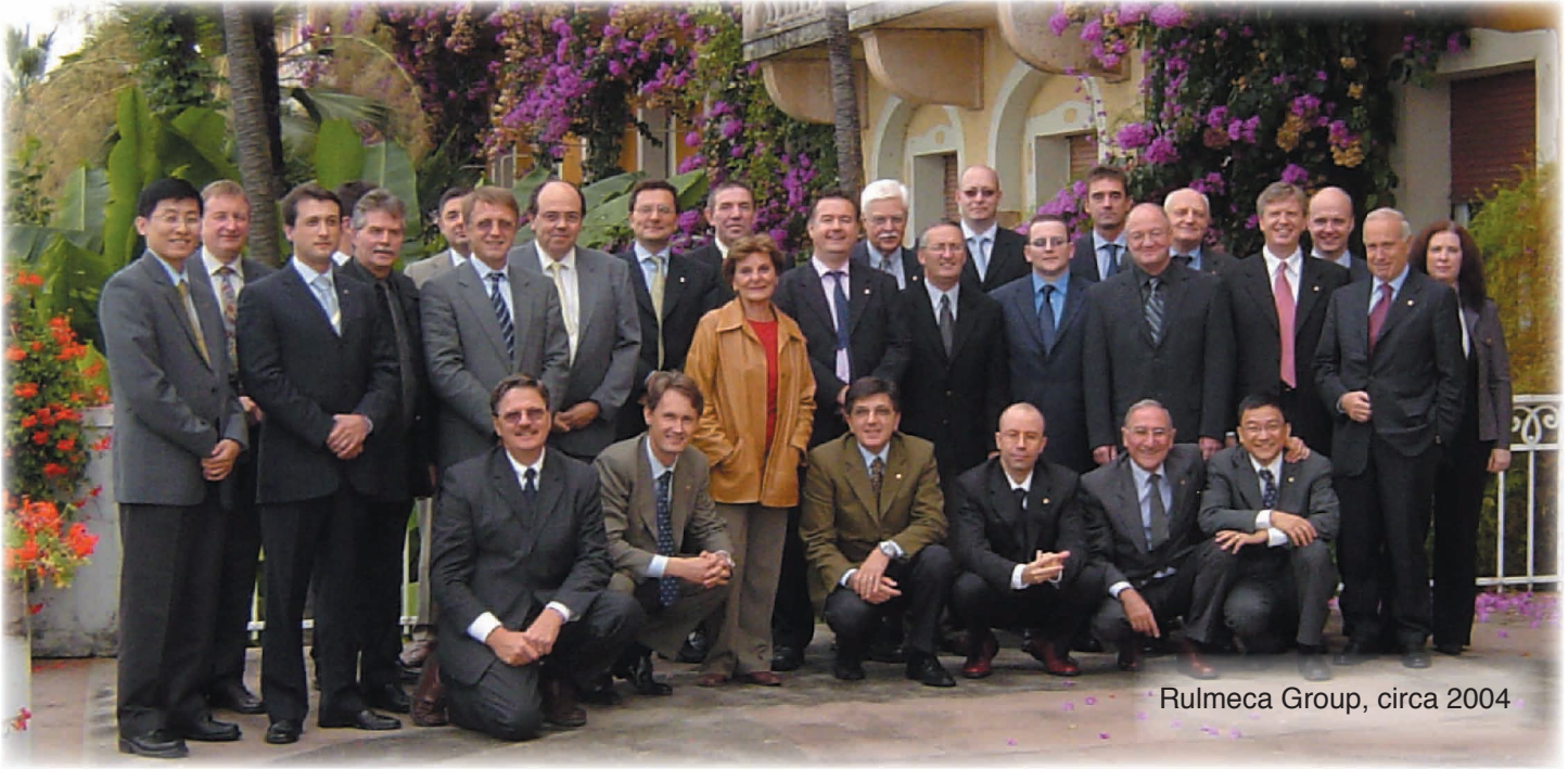
Rulmeca Group, circa 2004

limestone mining project is doing well today and commands a leading position in the Italian market. In 1999 Calce Ghisalberti merged with a group of other Italian companies to form Unicalce, which has been in operation the past five years with 11 limestone quarries across Italy.