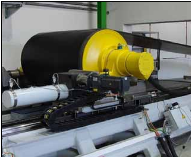
Figure 15 Photo shows model 1000HD at 330 HP under full load testing at Rulmeca Germany GmbH facility in Aschersleben, Germany.