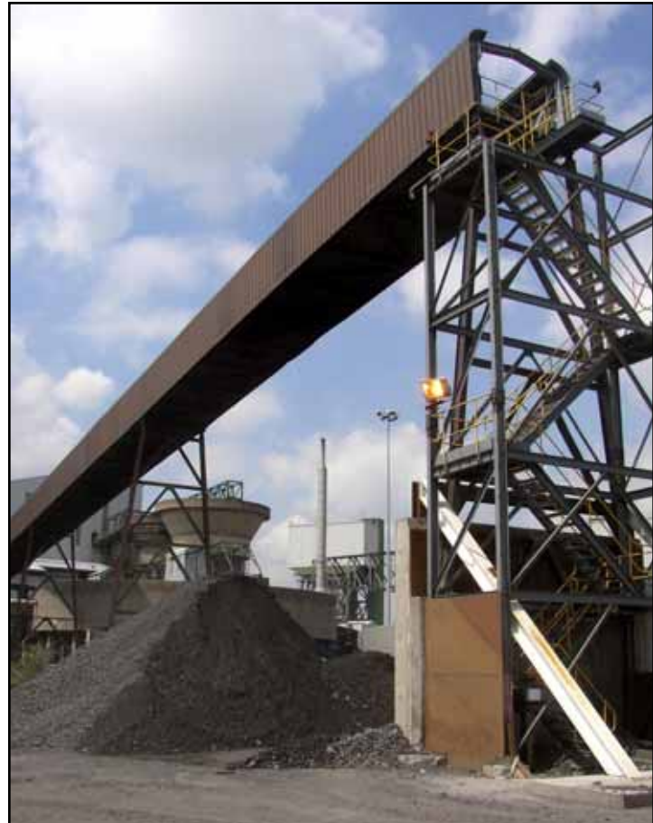
Figure 5 Kellingley Colliery replaced old problematic "bottom belt drive" near tail (left photo) on the main coarse discard conveyor in 2003 with 100 HP Rulmeca Motorized Pulley at discharge end above pile (right photo) and eliminated 300,000 tons of lost production annually.

Within three years UK Coal's installed base of Motorized Pulleys totaled 24, growing to 85 units by 2011. When power plants and terminals are included to the total, 120 Rulmeca Motorized Pulleys were installed in the UK (2 HP to 330 HP.) The primary motivation for the change in conveyor drive technology was the demonstrated annual savings of tens of thousands of dollars in reduced maintenance expense and electrical power consumption, initially on the Kellingley main coarse discard conveyor, then subsequently on numerous other conveyors at four other UK Coal prep plants.