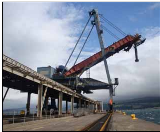
Figure 16 Model 1000HD will replace existing dock conveyor drive at this major Scottish coal export/import terminal in 2011.